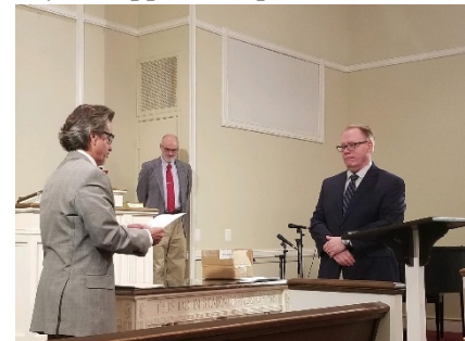
Thankful for Faithful Brothers and Mentors