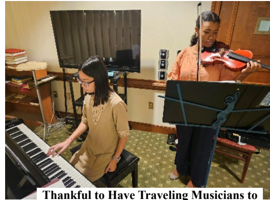
Thankful to Have Traveling Musicians to Accompany Singing in Worship