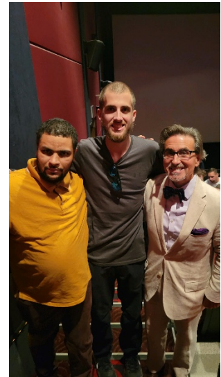
New Members at Word of Life!

Thank You for Your Prayers for Your RHM! Our Lord graciously promises us 'All things are