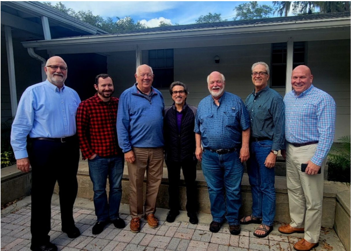
Co-Laborers, Servants, and Friends in Church Planting and Evangelism