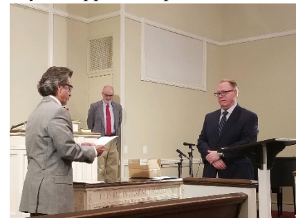
Thankful for Faithful Brothers and Mentors