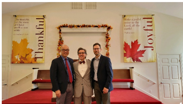
PMA Evangelism Conference 2024

(4) Seek to visit one of our organized PMA congregations every 6-8 weeks for RHM reports/updates and Ministry of God's Word.