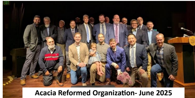
Acacia Reformed Organization- June 2025

Summary Prayer: "Please continue to pray for the Presbytery of the Mid Atlantic, that we would have peace and continue to be built up, and walking in the fear of the LORD and in the comfort of the Holy Spirit, we would multiply for the glory of God and the extension of Christ's Kingdom (Acts 9:31). Please pray that our faithful God would continue to bless our Berryville, VA, exploratory bible study with growth. Rejoice with us that He has blessed our present gospel discipleship, evangelism and church planting with much contentment, fruit, and joy, and that He will continue to open new doors (Col. 4:2-6)."