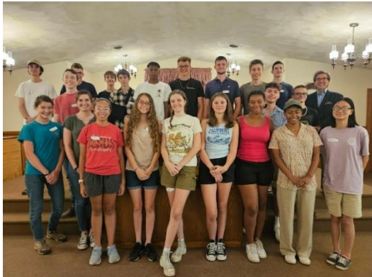
Tidewater Youth Conference- June 2025 (PSE)

Please pray for my regular visiting of organized congregations in the PMA for regional home mission's ministry. / Pray for my regular visiting of mission works in the PMA for regional home mission's ministry. / Pray for my regular Gospel ministry opportunities in discipleship and evangelism at Berryville, Providence Prep, and Cottage Schools. / Pray for my maximal fruitfulness and maximal joy as a husband, father, minister, and RHM. / Pray for opportunities for Gospel witness and new friendships for church planting and discipleship. / Pray for ongoing wisdom in church planting, mentoring, shepherding, and counseling as an RHM. / Pray as I continue to serve on our PMA's Candidates and Credentials Committee.