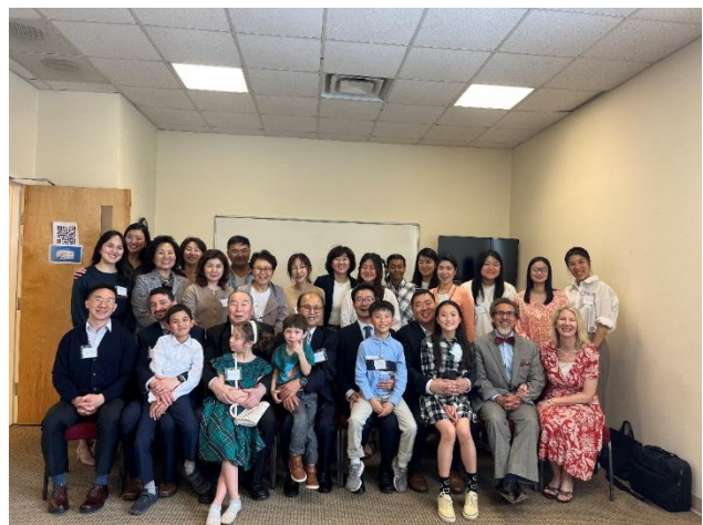
Emmaus Presbyterian Congregation- Spring 2025

Word of Life- Serving on session/ministry and mentoring / Emmaus Presbyterian Church- Assisting congregation in serving as a pastoral-ministerial guide in transferring into the OPC / West Creek OPC- Serving on session/mentoring and ministry / Berryville Bible Study- Continuing to teach twice monthly and shepherd the folks who attend. / Church Planting/Evangelism Summer Intern / Trinity Reformed, Lanham, MD- Serving as a minister/elder. / Candidates and Credentials Committee for PMA.