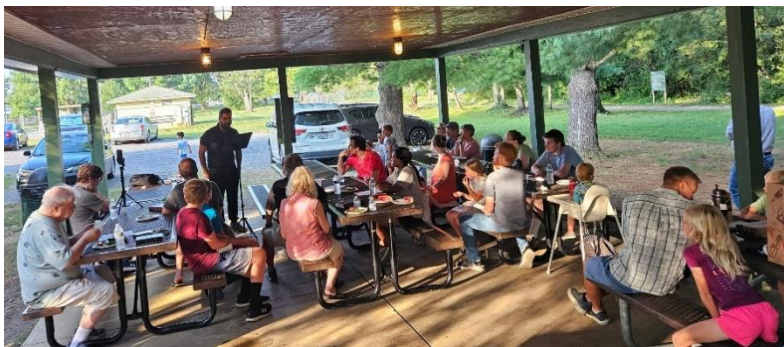
Berryville Bible Study- Summer 2025

Clark County Fair Outreach/Flea Market Outreach.