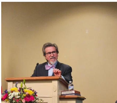
Preaching at NCPC Missions Conference

theology in evangelism and on the mission field. I