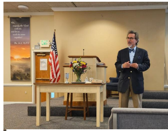
“Evangelism for Those Who Do Not Do Evangelism” Session at NCPC Missions Conference