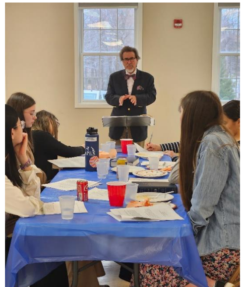
Apologetics-Evangelism Seminar with Young Adults at Grace OPC