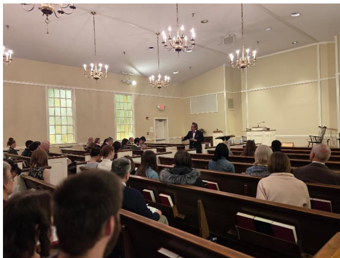
Evangelism Seminar at Grace OPC

Grace OPC, Vienna, VA: I had the thrill and privilege of ministering God's word in worship, and teaching a Sunday School Seminar on Evangelism to the adults and the youth. Later in the day, I had the wonderful privilege of doing an apologetics-evangelism seminar with the young adults.