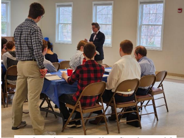
Apologetics-Evangelism Seminar with Young Adults at Grace OPC

evangelism and the importance of possessing sound